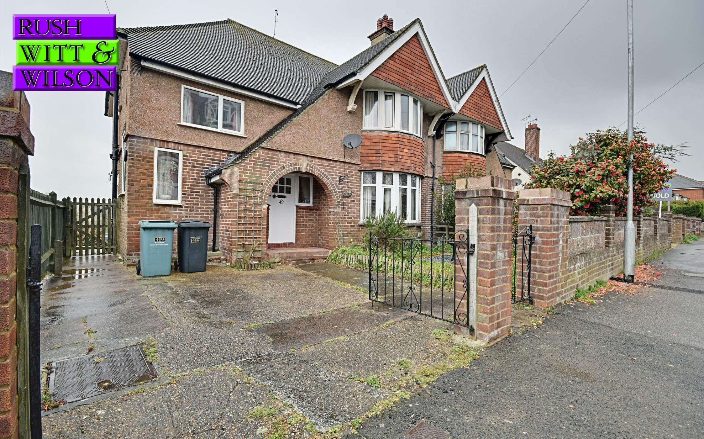
49 Amherst Road, Bexhill-On-Sea, East Sussex TN40 1QN £395,000